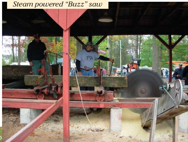
Steam powered "Buzz" saw

We had our tent and table set up for club info, hats, and shirts. We didn't sell much but we did pickup two new members. It seemed like club members were spread out at different events over the weekend, so there weren't a lot of members in attendance to volunteer as there normally are. The day consisted of different displays, tractor pulls, and the flea market. There was a lot of 'high quality junk' at the flea market, and you can see how much of an affect the downfall of the economy had on everyone-Lots of people but not too many buyers.