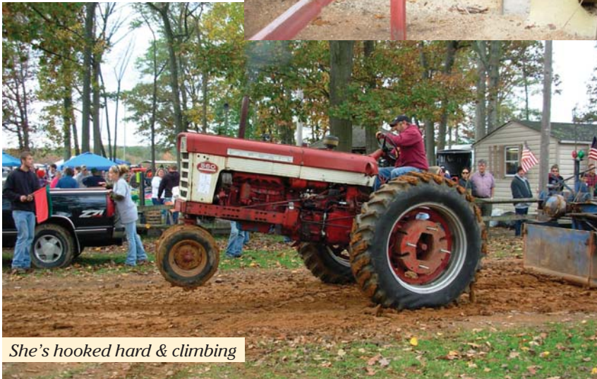
She's hooked hard & climbing